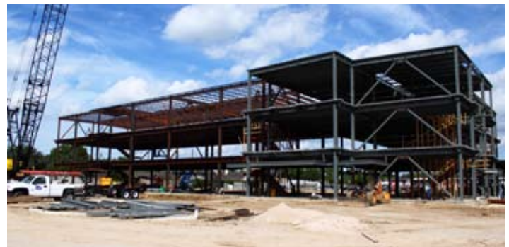
Educational Wing (Main Entrance Center)