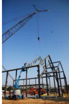
Large Truss Placed on Worship Space