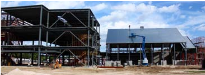
Worship Space (Main Entrance on Left)