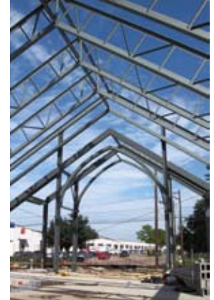
Worship Space Steel Completed