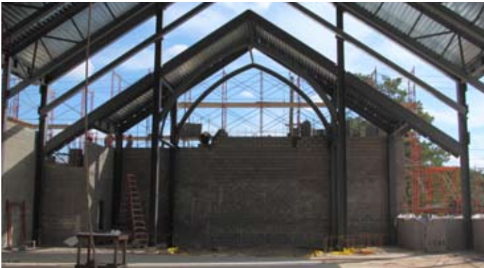
Concrete Block Walls are Built in Worship Space