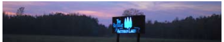
Artesian Lakes Sign